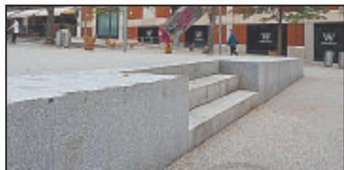
Danger zone: The Trinity Square drop-off SU52600

Two injured on controversial high street feature